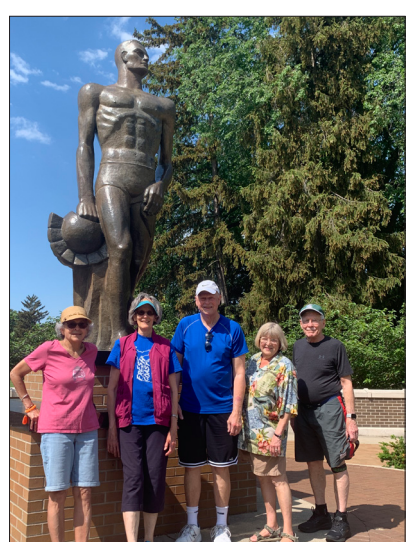
Walking on campus sometimes involves a photo taken at the Sparty statue.